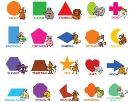
Shapes Pack (20no)