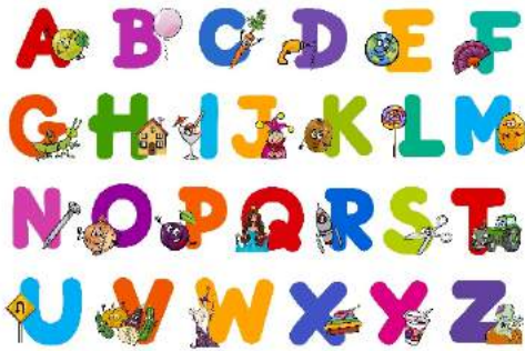
Alphabet Pack (26no)

A low-cost option to revive existing cubicles or as an addition to your new washroom. Providing an opportunity for children to learn whilst creating a fun and colourful environment.