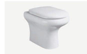
CHWC102 • SanCeram Chartham Back to Wall WC