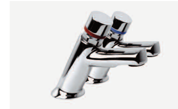
SCBW124 • SanCeram Contemporary Press Action taps