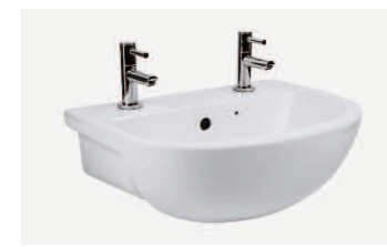
CHWB108 • SanCeram Chartham 450 Semi-Recessed Basin