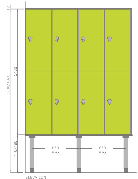
image shows the 13mm SGL with slots