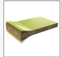
HPL – High Pressure Laminate