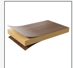
Real Wood Veneer