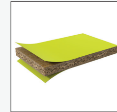
MFC – Melamine Faced Chipboard

Solid surface is manufactured from an advanced composition of minerals and acrylic polymer that delivers a seamless finish to vanity tops and is exceptionally hardwearing.