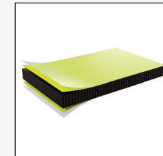
SGL – Solid Grade Laminate