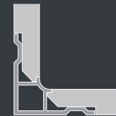
Rear upstand extrusion

All SGL vanity unit profiles are linked using aluminium extrusions in Silver or Charcoal Grey Powder Coat.