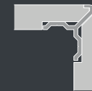
Front downstand extrusion